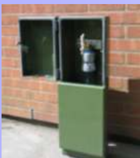
Hinged Tap Cover Good access to tap Can be closed with hose fitted