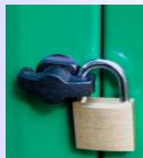
Secure latch will accept standard padlock