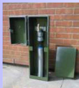
Lower Access Panel Can be removed for installation & service access